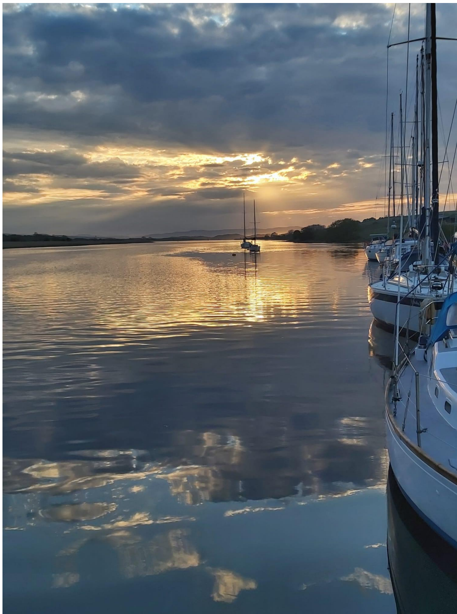
Image of the day - Sunset on the River Bann