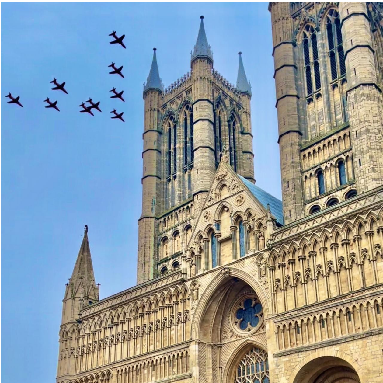
Image of the day - Lincoln Cathedral