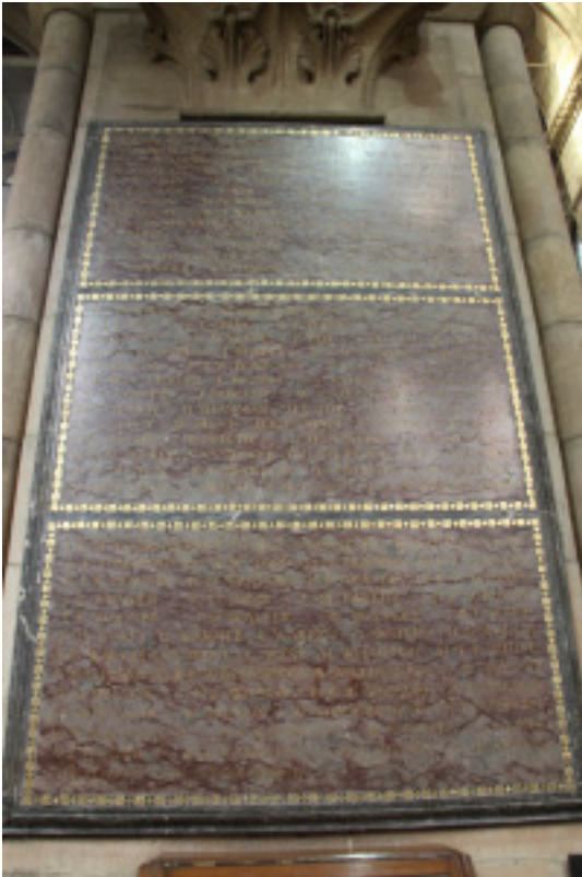
The Heroes Column – War Memorial in St Fin Barre's Cathedral, Cork

The War Memorial in St Fin Barre's Cathedral, Cork – known as 'The Heroes' Column' – like war memorials in other churches and public places throughout Cork City and County will provide a natural focus for centenary remembrance of the First World War, 1914-1918, and our prayers for peace, justice and reconciliation in our time.