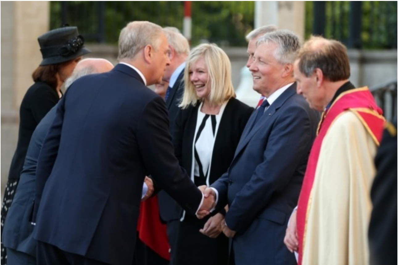
HRH The Duke of York and First Minister Peter Robinson at the Remembrance Service in St Annes Cathedral