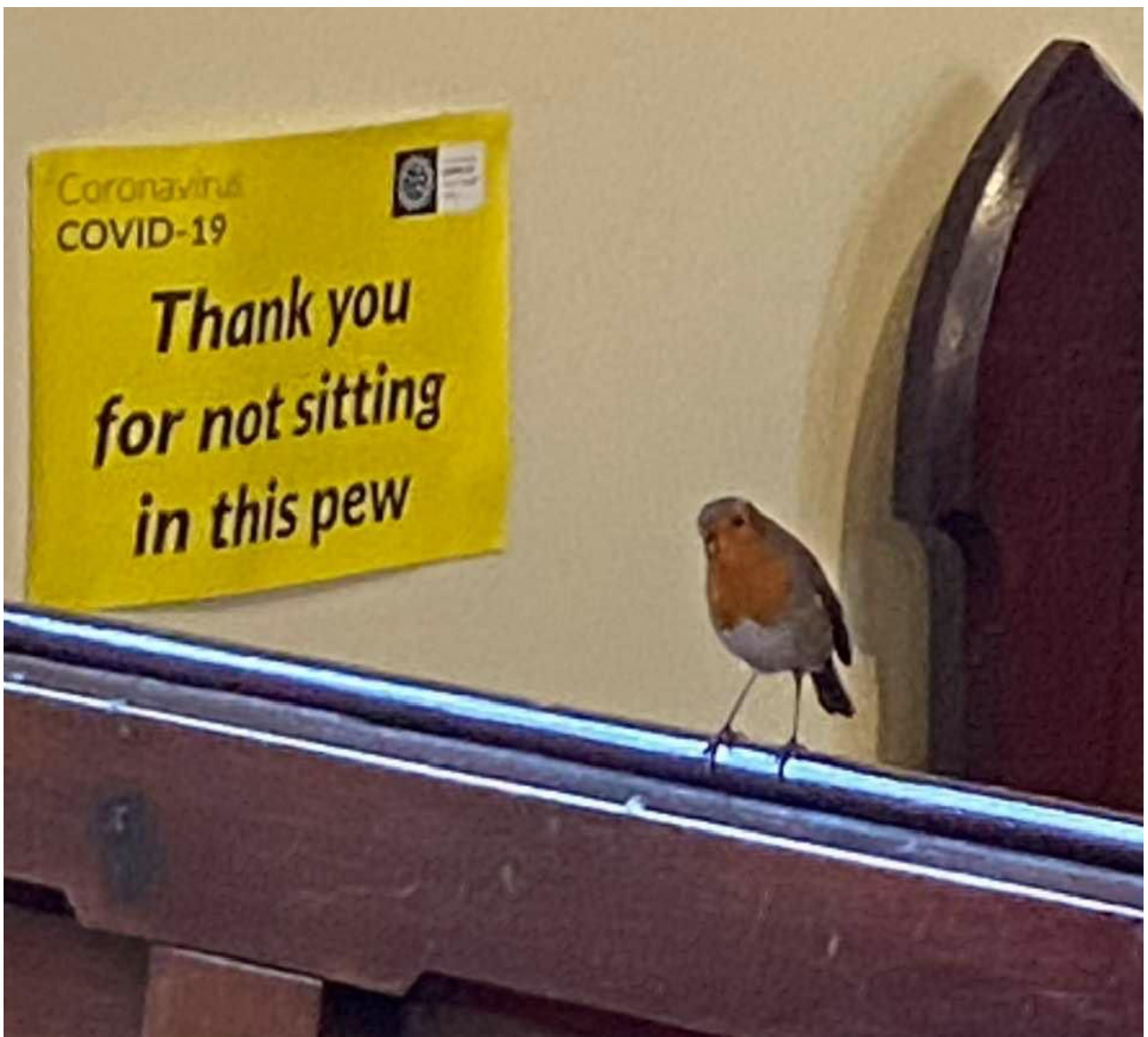
Image of the day - Just visiting