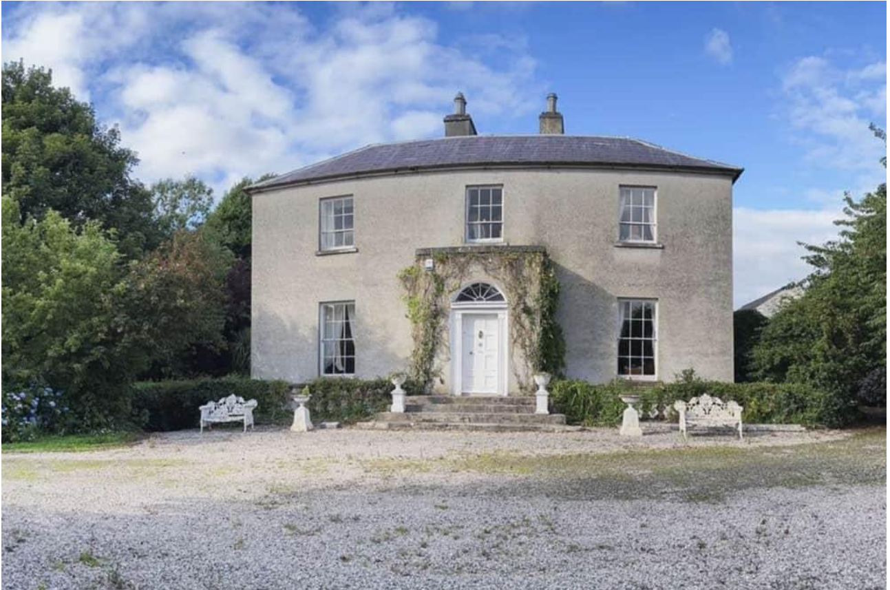
Image of the day – Holiday in Cecil Francis Alexander's old rectory