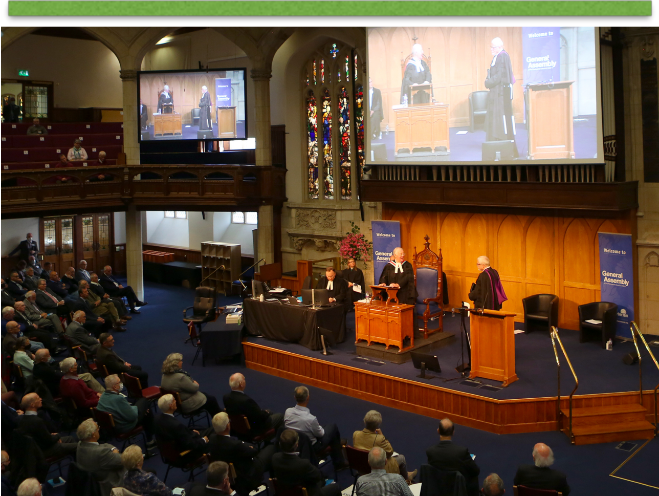
Image of the day - Opening of General Assembly 2021