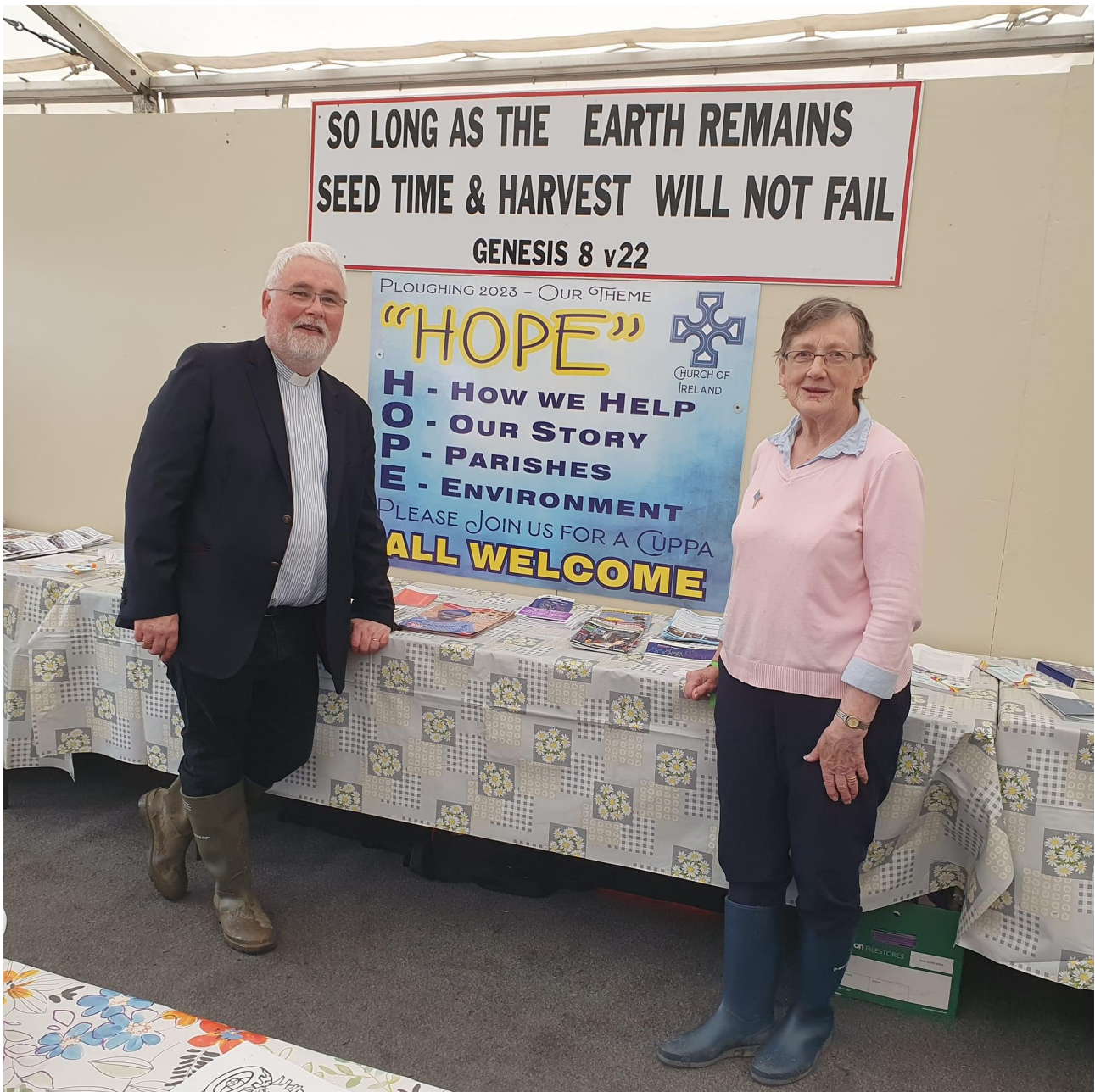
Two photos above - Bishop of Cashel Ferns and Ossory clergy and parishioners at C of I stand

continued to attract participants and visitors despite the most inclement weather which flooded several areas and roads.