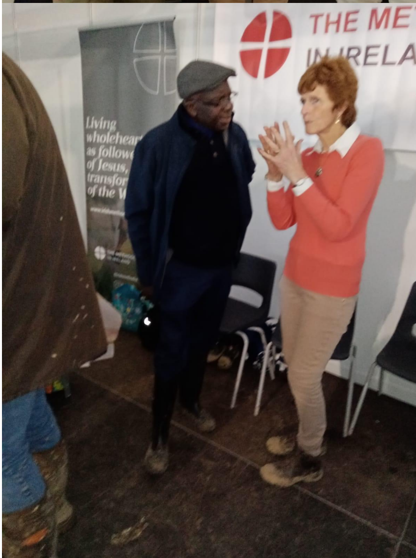
Methodist President above left, at his church's stand

supporting the work of the Church at the National Ploughing Methodist President above left, at his church's stand Championships.