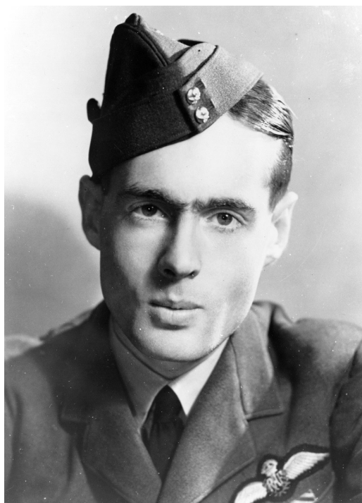
Group Captain Leonard Cheshire - see page 4